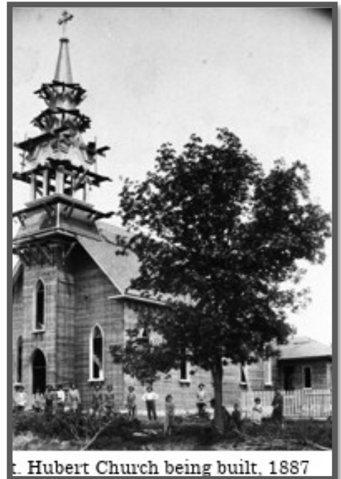
Hubert Church being built. 1887